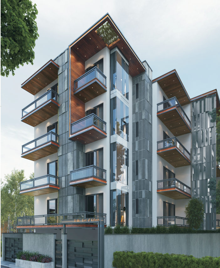
D-66, EAST OF KAILASH