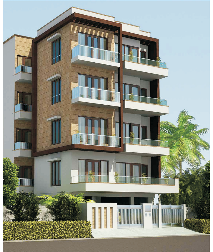
K-1995, CHITTARANJAN PARK