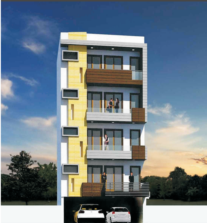
G-1252, CHITTARANJAN PARK