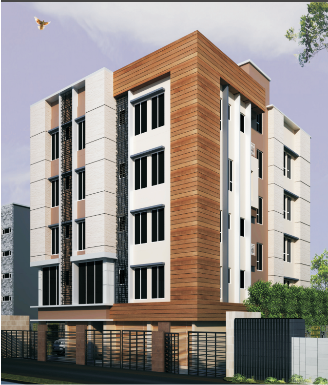
192 Harish Mukherjee Road