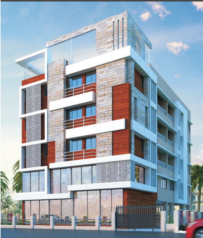
117 S P Mukharjee