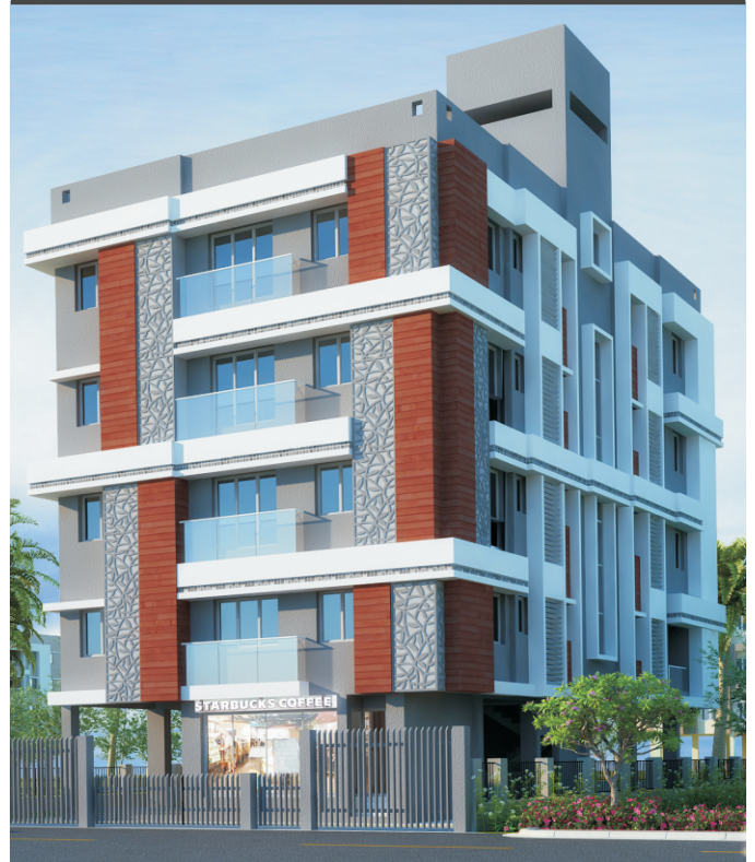
55 South End Park