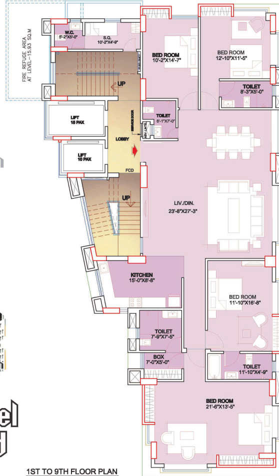
1ST TO 9TH FLOOR PLAN