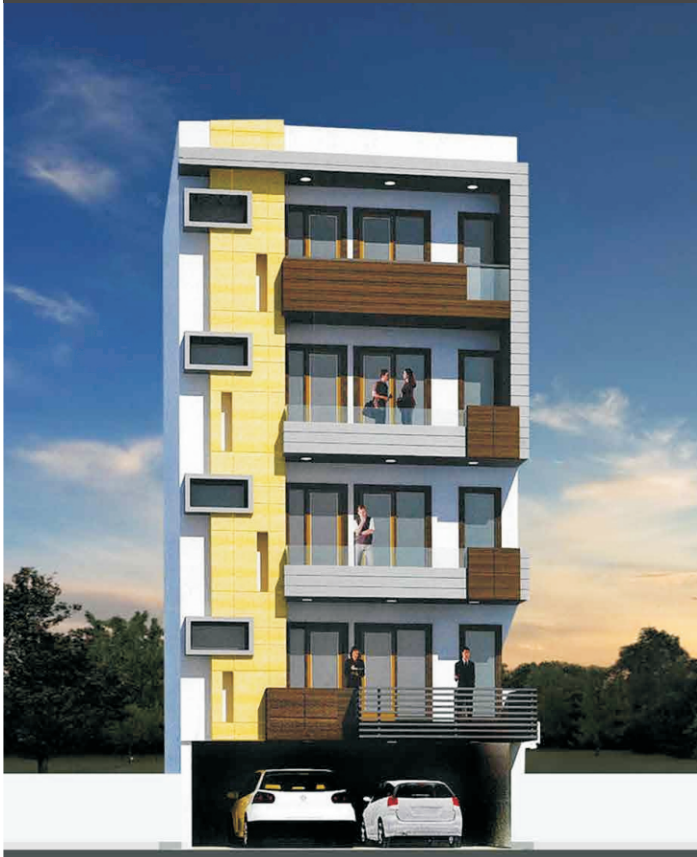
G-1252, CHITTARANJAN PARK