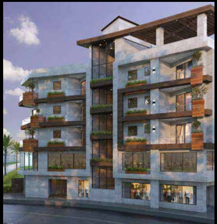
134/2 Meghnad Saha Sarani