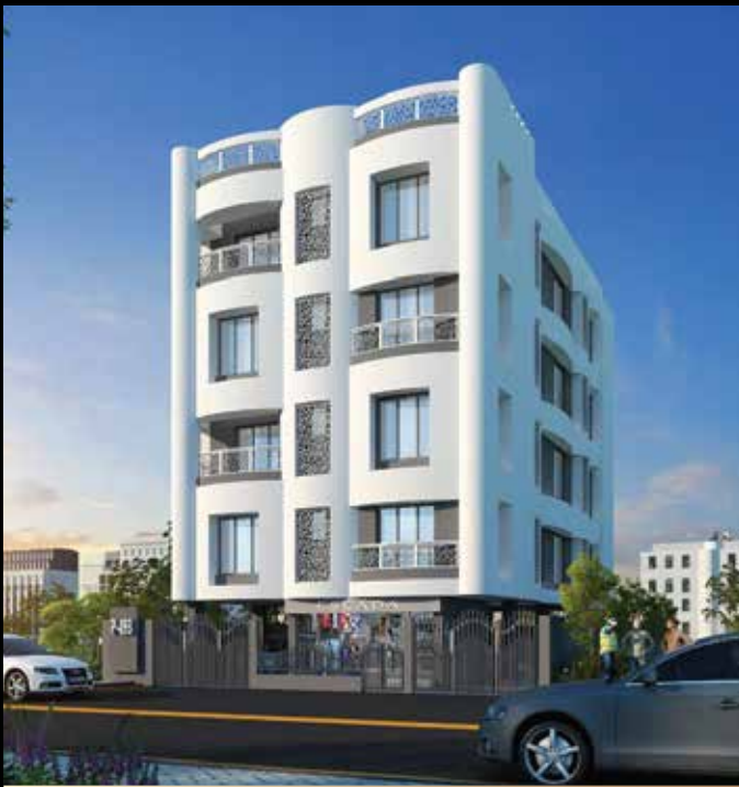
493 Keyatalla Road