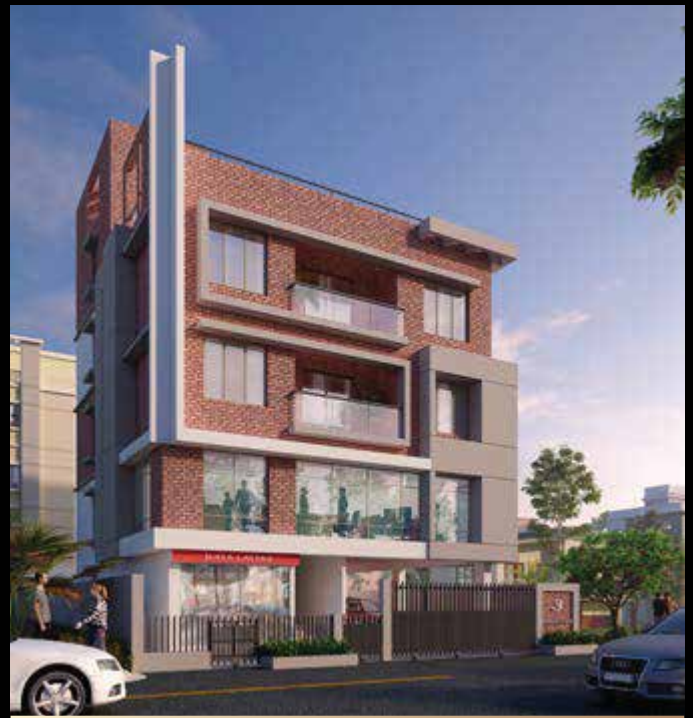
3 Satyendutta Road