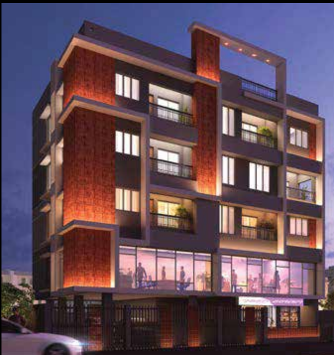
63/1A Pratapaditya Road