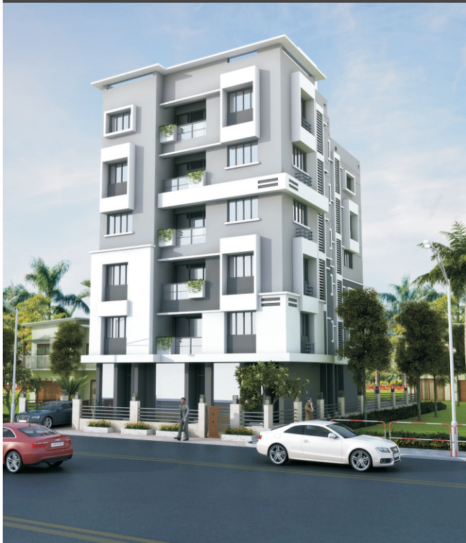
244, Rash Behari Avenue