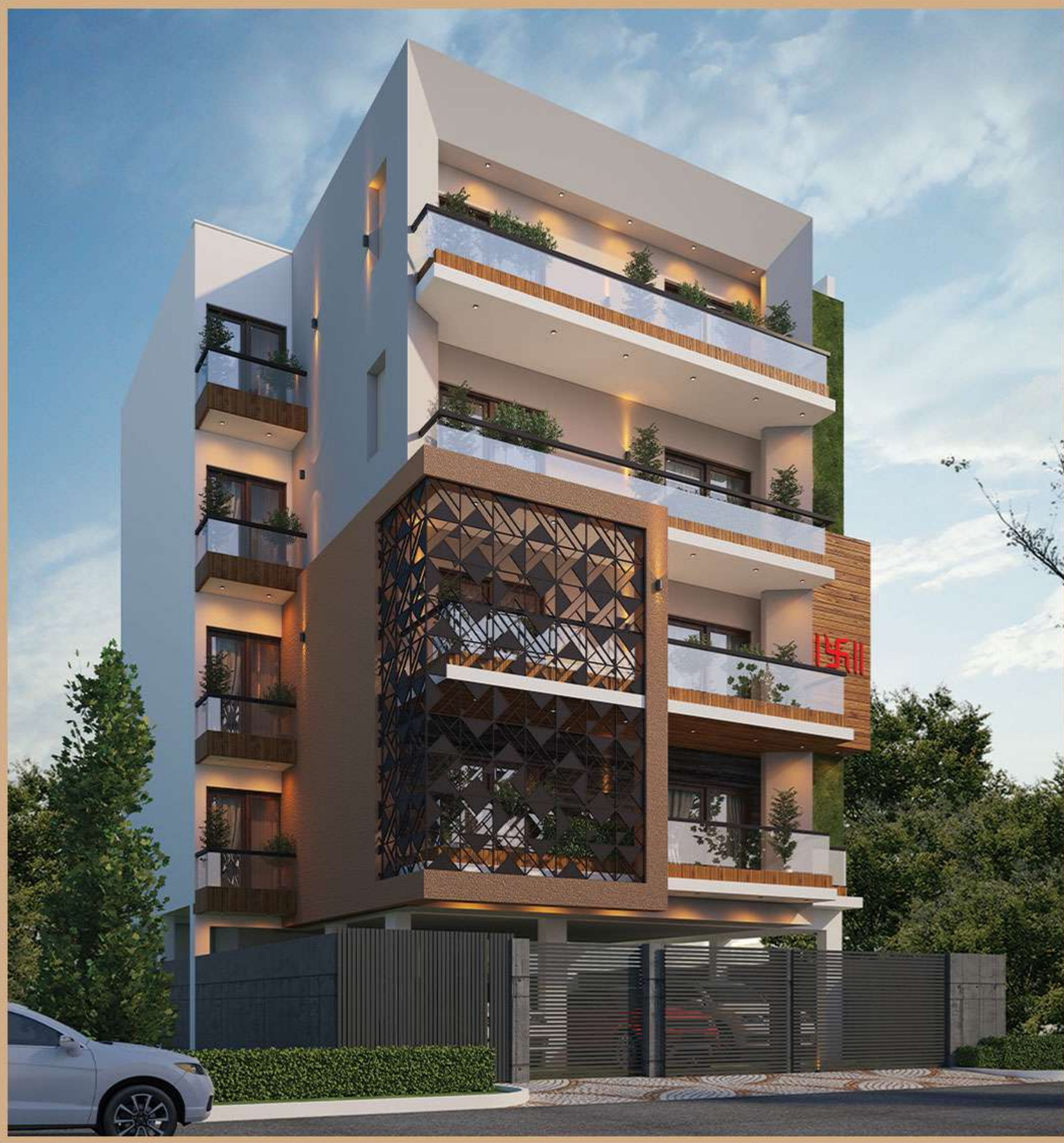
J - 1835, CHITTARANJAN PARK