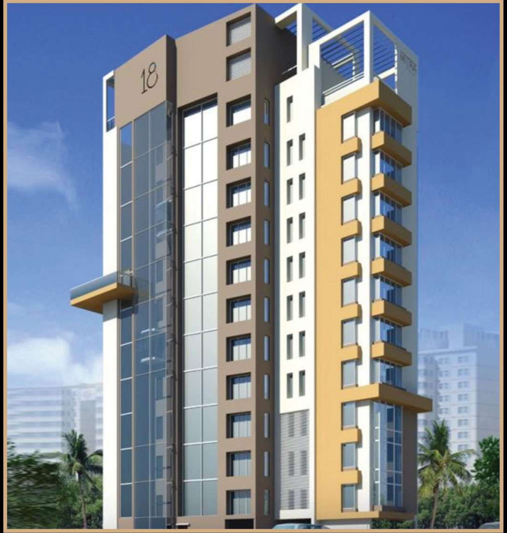
18, BONDEL ROAD