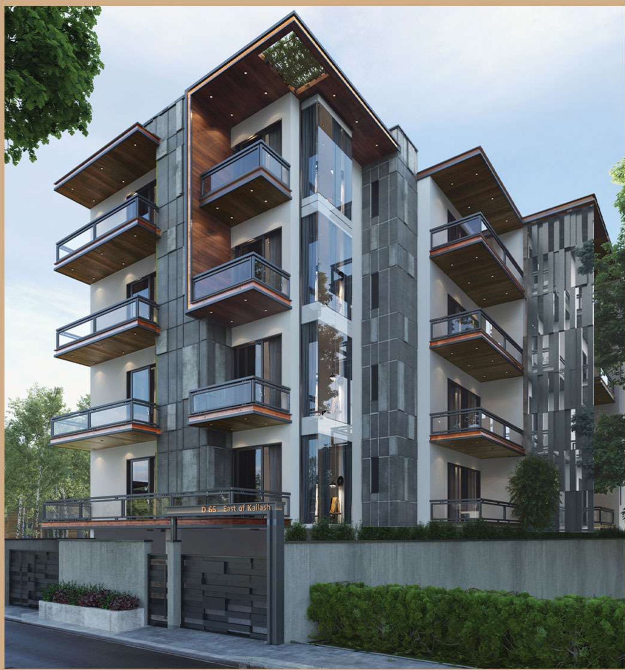
D-66, EAST OF KAILASH