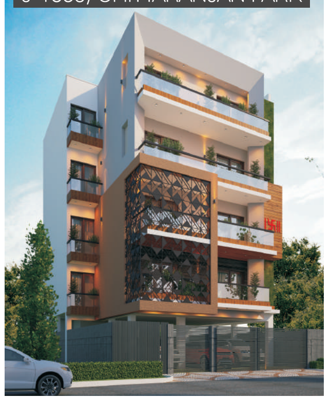
J-1835, CHITTARANJAN PARK