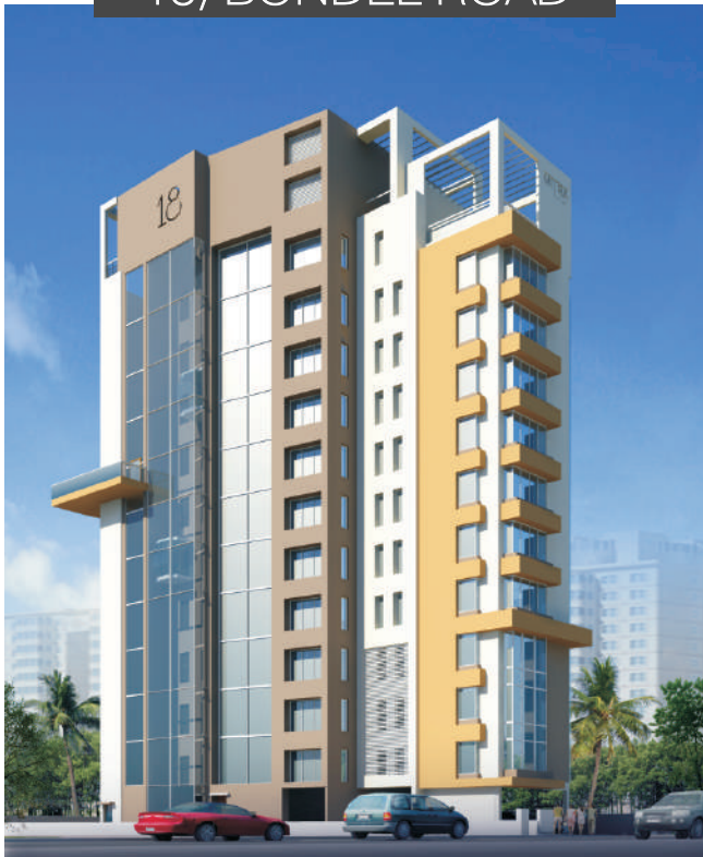
18, BONDEL ROAD