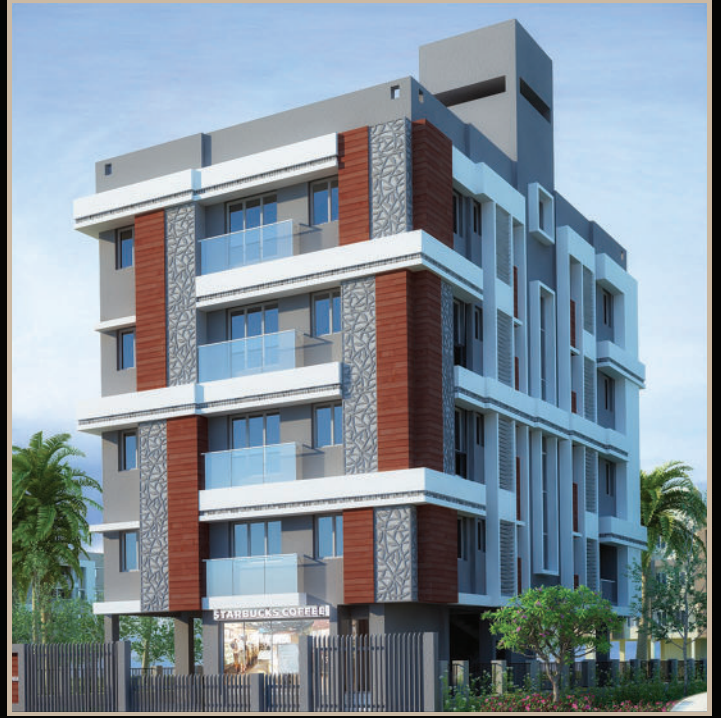
55, SOUTHEND PARK