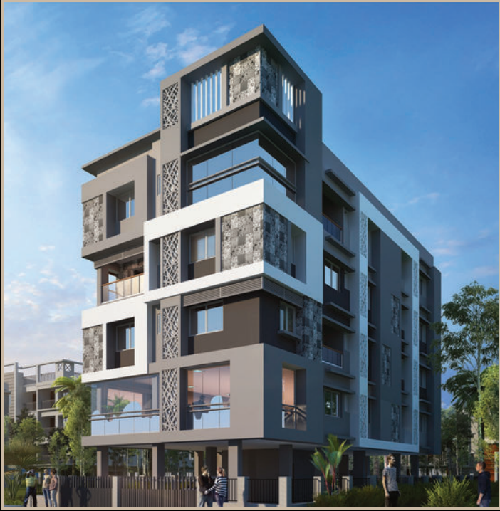
44, LAKE TEMPLE ROAD