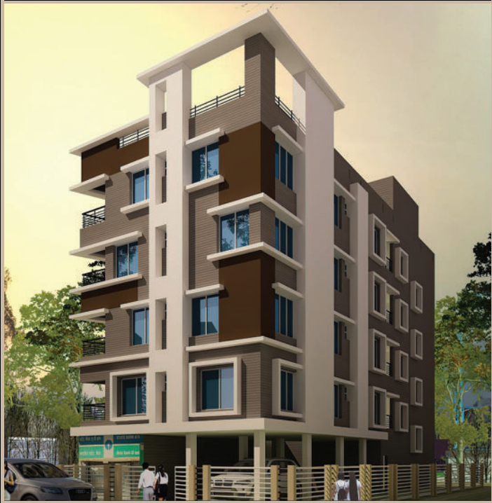
4B, MOTILAL NEHRU ROAD